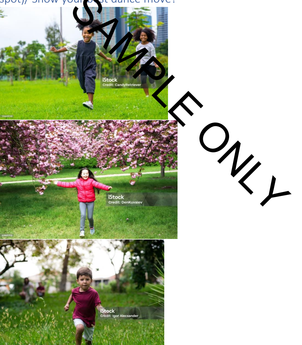
April 2, 2024

Run as fast as you can between two things (botanical gardens set up a spot)/ Show your asst dance move?